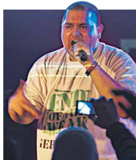
Drob Dynamic fires up the audience in Berlin.

"Kreuzberg was crying out as the rents kept getting higher and higher, big shot investors bought our homes and flipped them to outsiders, just to make a little dough."