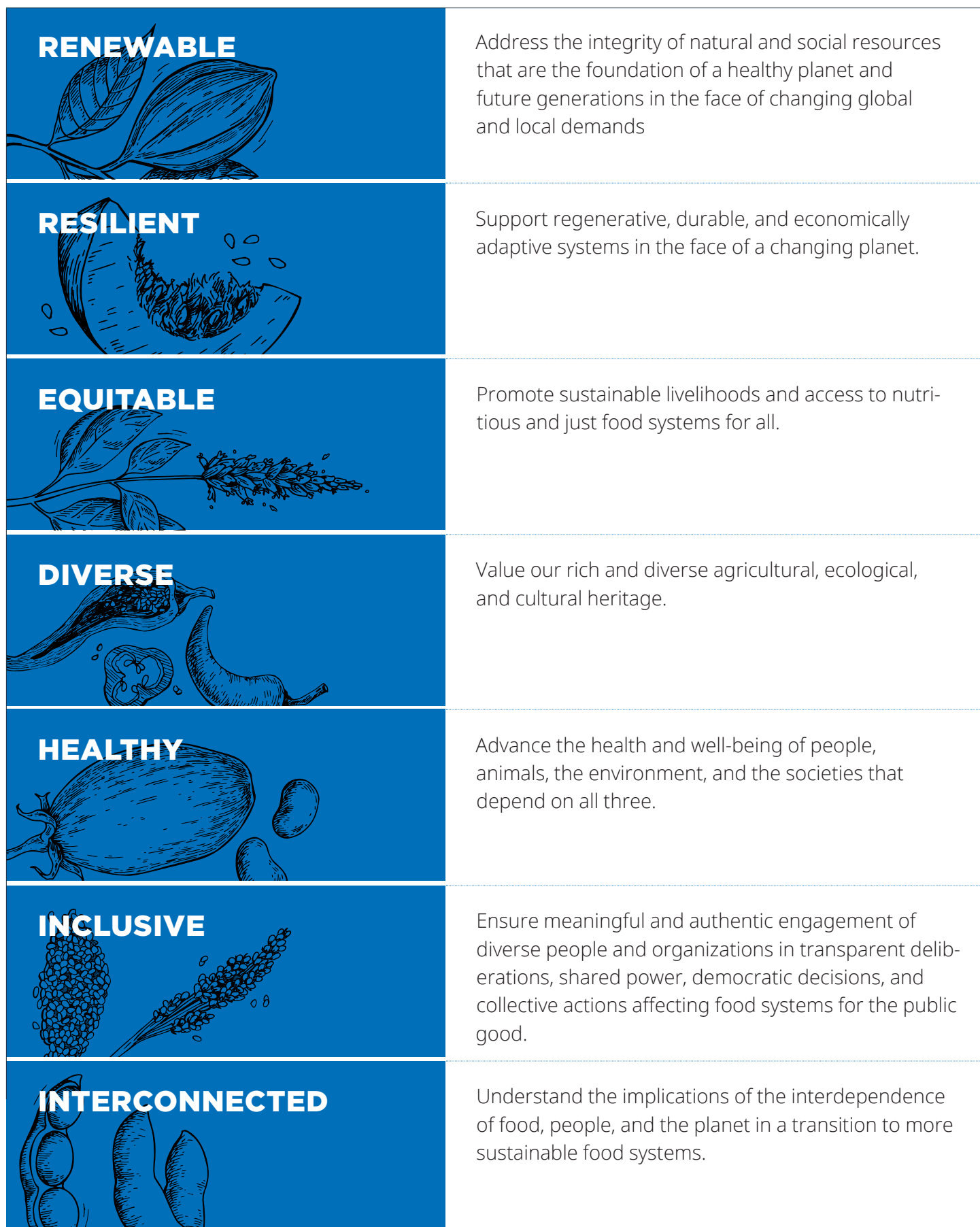
TABLE 2: GLOBAL ALLIANCE'S SEVEN PRINCIPLES FOR THE FUTURE OF FOOD